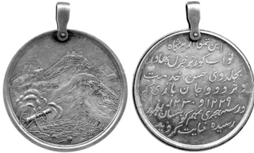
14 The Honourable East India Company's Medal for Nepaul, 1814-16 , in silver, 52.2 mm., an early Calcutta mint restrike, the reverse die showing first signs of deterioration, with riveted loop suspension, extremely fine £300-500